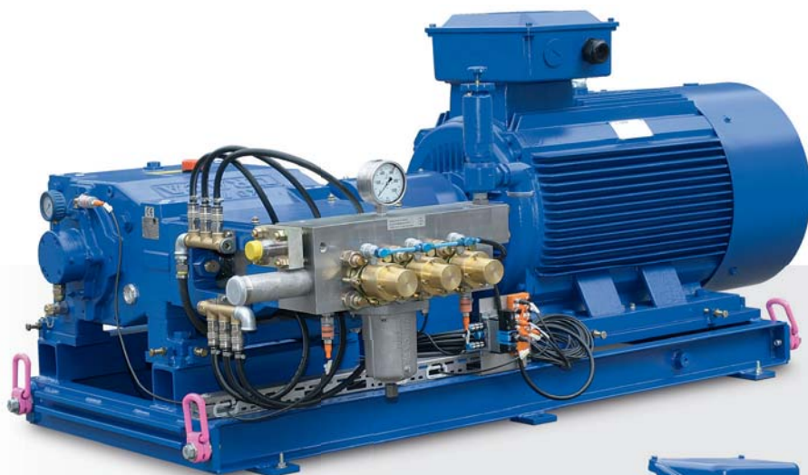
High-pressure pump unit KD724 with suction valve release for fast and accurate load changes as well as sensors for operating data logging