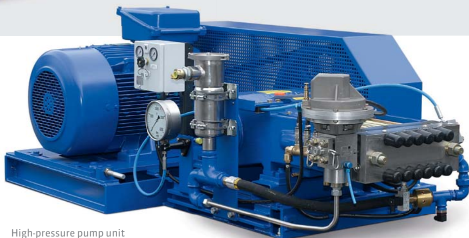
High-pressure pump unit KD719 with belt-drive